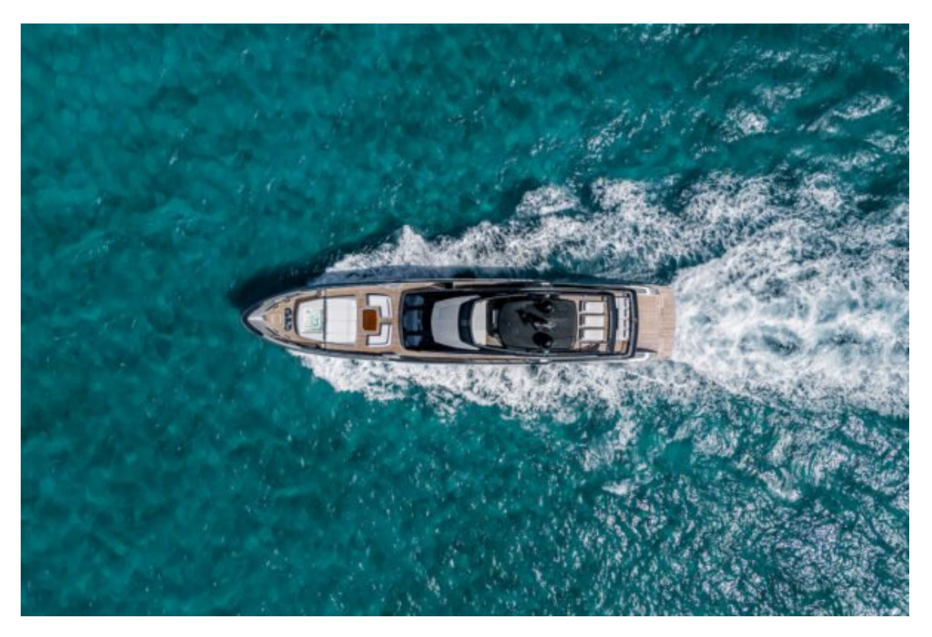
The sun deck hardtop enables you to manage the shade as you wish. On the main deck, in addition to the delightful stern beach club area and versatile aft cockpit, the elevated bow provides a convivial wraparound breakfast or lunch venue, a vast sunpad and an indulgent hot tub.

With four sublime decks, the variety of outside spaces is astonishing. Both the upper and sun decks provide 10-person dining areas, as well as openplan aft spaces with freestanding lounge furniture and spectacular views.