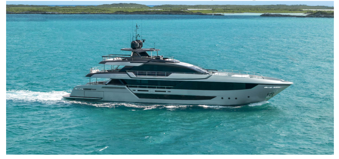
with a CE certification class (A) and can navigate the open ocean.